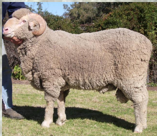
LM05-364 (× Charinga WC) 92kg @ 15 months

A correct sire combining a bold, very soft and productive white wool