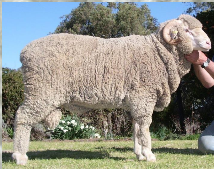
LM05-05 (AI bred × Jnr12) 86kg @ 13 months

“Breeding for big sheep with great wools”